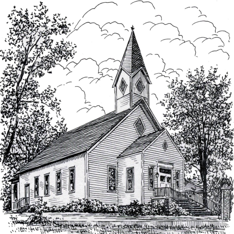
Philadelphia Presbyterian Church Clayton County, Georgia ~ Organized 1825